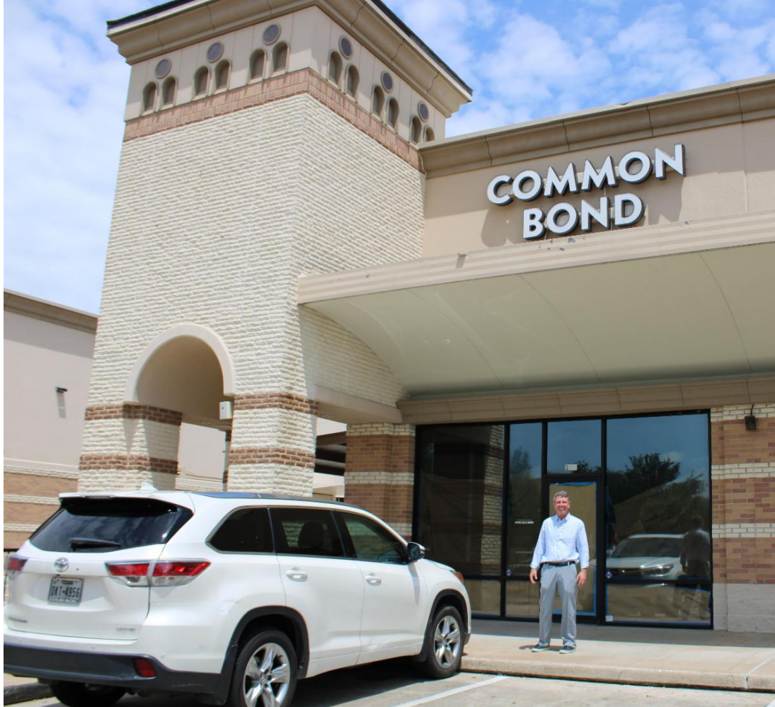
Common Bond On-The-Go is opening on Eldridge Parkway on July 7. Free chocolate chip cookies and gift card giveaways are all on the agenda!

Construction delayed the opening of Common Bond On-The-Go in The Energy Corridor District but the big day is almost here!