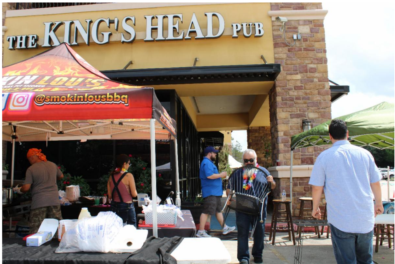
The King's Head Pub at 1809 Eldridge Parkway celebrated its 10-year anniversary on April 23 and April 24. Residents and patrons came out to drink, listen to live music, shop at street vendors and enjoy BBQ and crawfish.

Hurricane Harvey. Pandemic. Freeze. More pandemic.